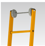
Wheel on top