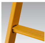
52 mm anti slip steps