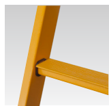
52 mm anti slip steps