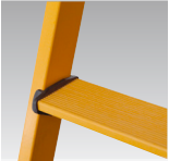
88 mm anti slip steps