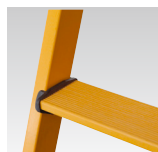
88 mm anti slip steps